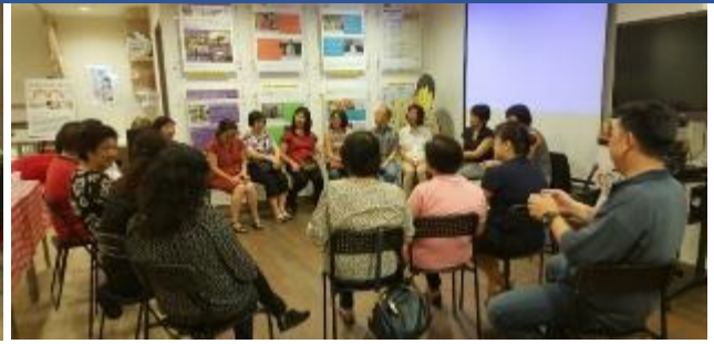
Caregiver-to-Caregiver Classes at CareConnect TTSH